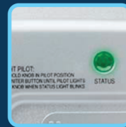
Gas Control Valve with Exclusive GREEN LED Indicator