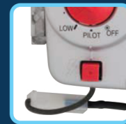
Integrated Piezo Igniter