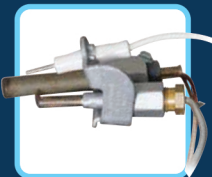
Thermopile (no electricity required)